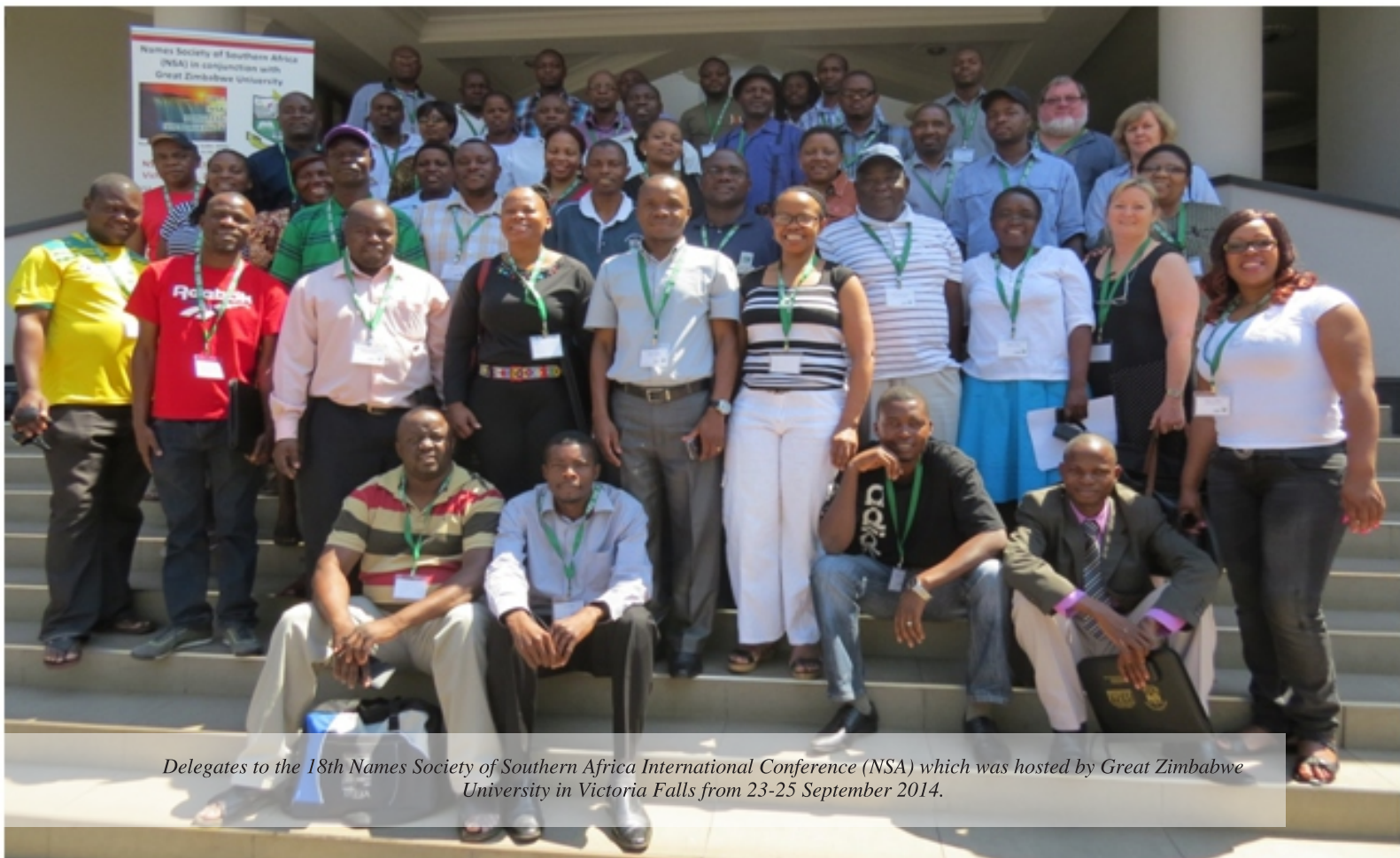
Delegates to the 18th Names Society of Southern Africa International Conference (NSA) which was hosted by Great Zimbabwe University in Victoria Falls from 23-25 September 2014.

Delegates to the 18th Names Society of Southern Africa International Conference (NSA) which was hosted by Great Zimbabwe University in Victoria Falls from 23-25 September, have hailed the University, through the Faculty of Arts, for successfully hosting the biannual event.