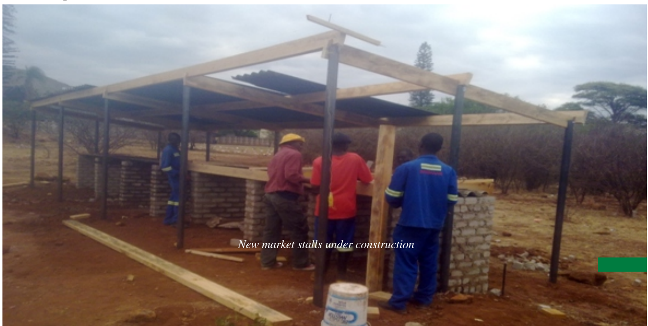
New market stalls under construction