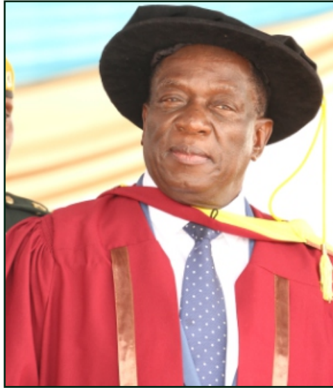
Chancellor, Cde Emmerson D. Mnangagwa

LLB (University of London), Hon. LLD (MSU), Hon. DPIR (GZU), Hon. LLD (UZ), Hon. D. Eng. (CUT)