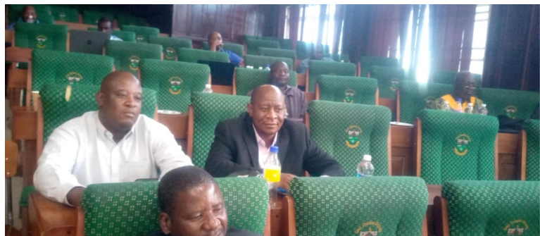
Workshop participants pay attention to proceedings