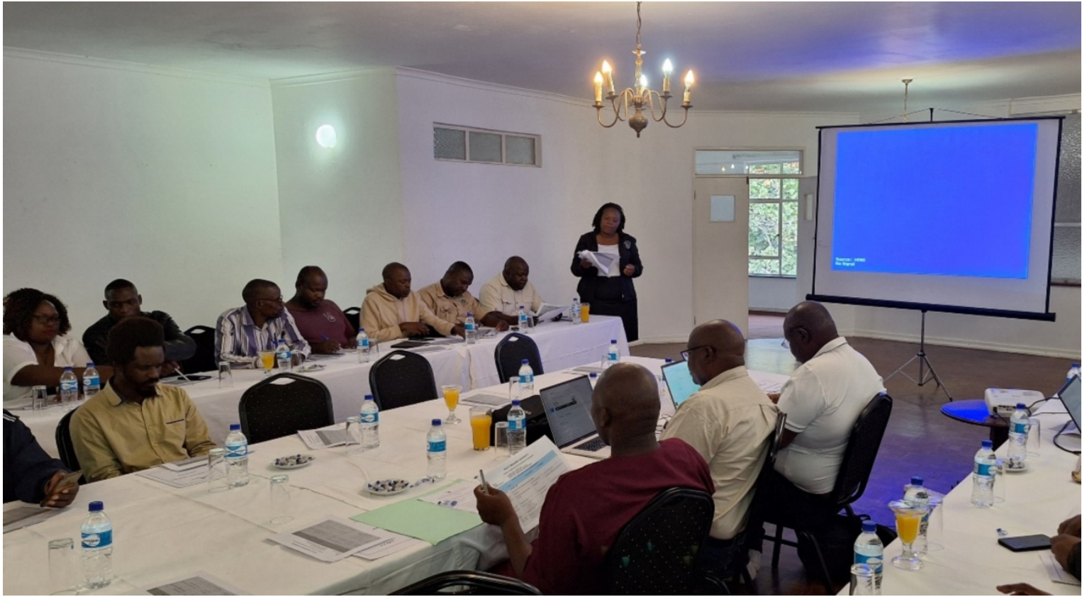
Attendees following proceedings during the Induction Workshop

In a verge to foster a healthy and productive environment, Great Zimbabwe University hosted a two-day Workers Committee Induction Workshop for recently elected workers' representatives. The workshop, was facilitated by Labour Officers from the Ministry of Labour and Social Welfare at Brondesbury Park Hotel in Nyanga.