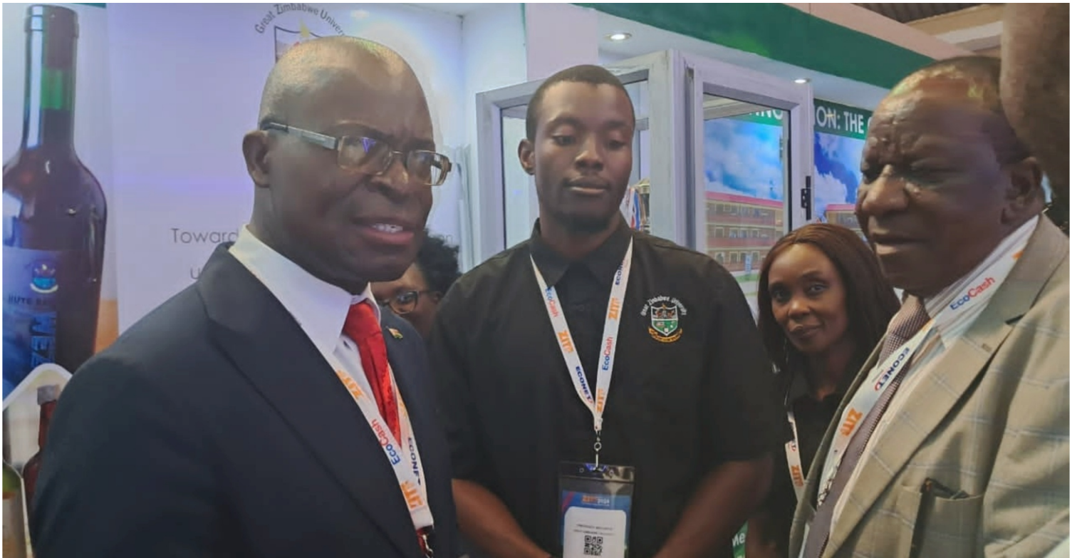
Minister of Higher and Tertiary Education, Innovation, Science and Technology Development, Professor dr. Amon Murwira tours the GZU stand at ZITF 2024 in the company of GZU Vice Chancellor Professor Rungano Zvobgo