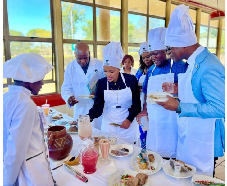
Honourable Barbra Rwodzi, Honourable Ezra Chadzamira and Honourable Professor Amon Murwira enjoying a culinary experience at the cookout

Great Zimbabwe University totally dominated Amai's Traditional Provincial Cookout Competition that was held at Masvingo Polytechnic College on the 2nd and 3rd of May 2024 with its chefs winning top prizes.