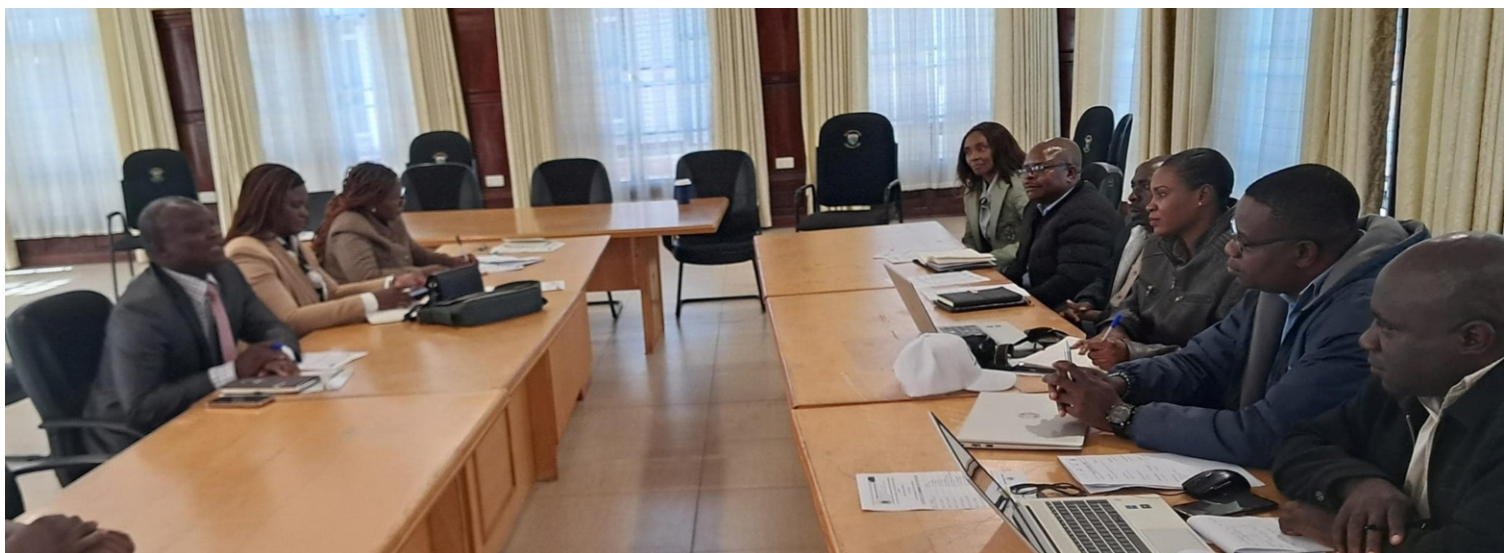
Discussions during the Projection Inception Workshop.

The project is being done in collaboration with the Durban University of Technology (South Africa) and the National University of Science and Technology (NUST).