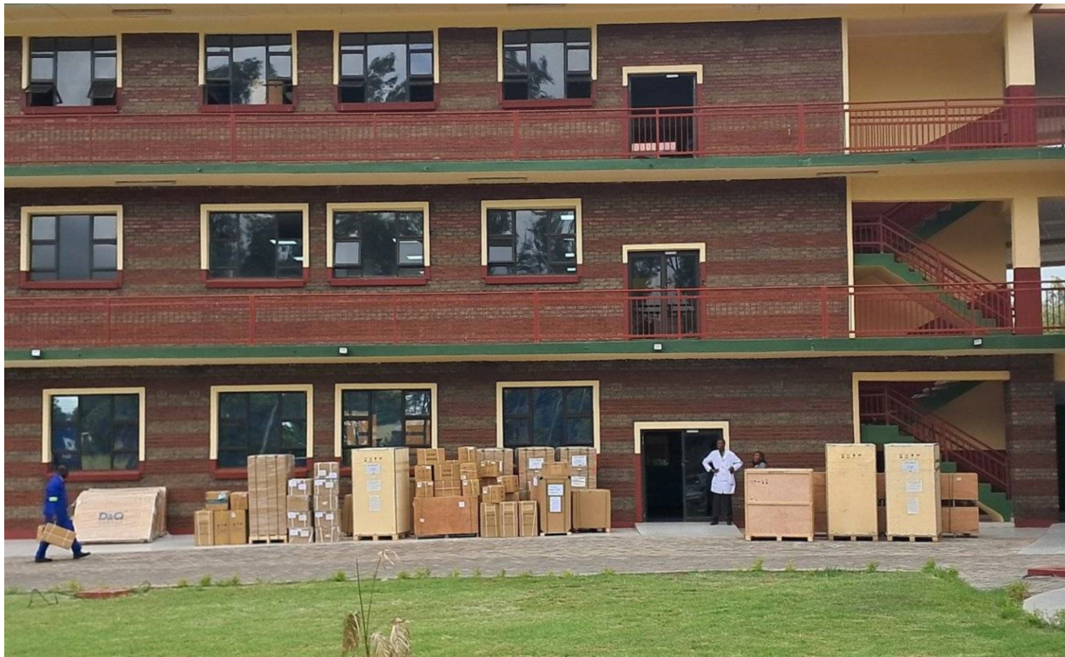
The recently procured medical equipment