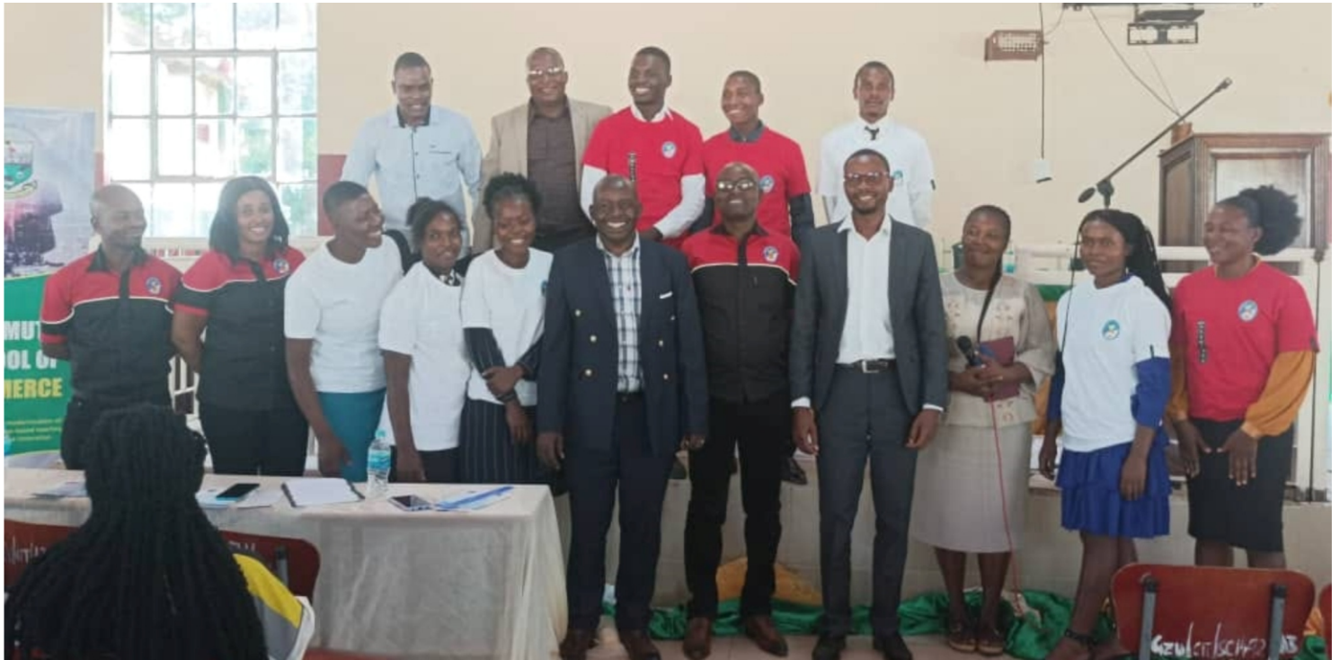
IIZ and Risk Management and Insurance Club pose for a group photo

Great Zimbabwe University has taken a significant step in equipping its students with vital industry-relevant skills by launching the Risk Management and Insurance Club. In collaboration with the Insurance Institute of Zimbabwe (IIZ), GZU has established this club to provide an engaging platform for students to deepen their understanding of risk management and insurance.