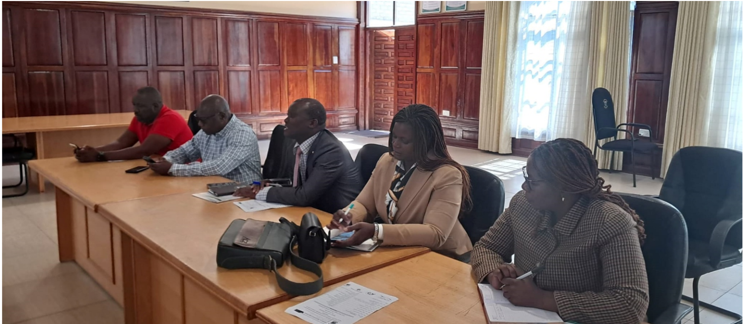
GZU management during the meeting

G reat Zimbabwe University (GZU) has received a USD45 000 grant from the Research Council of Zimbabwe (RCZ). The grant is for the University's Smart Poultry Farming: Revolutionizing Agriculture in Zimbabwe project. The major thrust of the project is to develop and implement a comprehensive artificial intelligence (AI)-driven Smart Poultry Farm (SPF). Among the key objectives of the project is the attainment of a proper management system that reduces expenses and conserves energy in poultry farming.