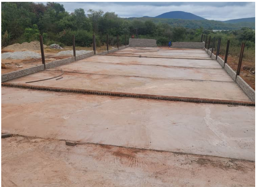
Fowl runs under construction at the farm