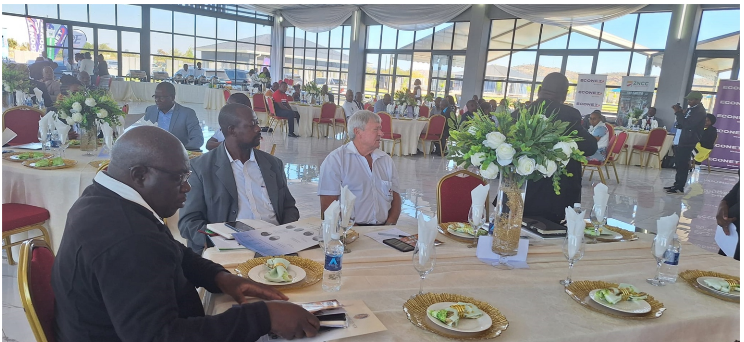
Delegates following the proceedings

The highly subscribed event attracted players from industry and commerce as well as from the academia. It was held at the Urban Lifestyles Hotel in Masvingo.