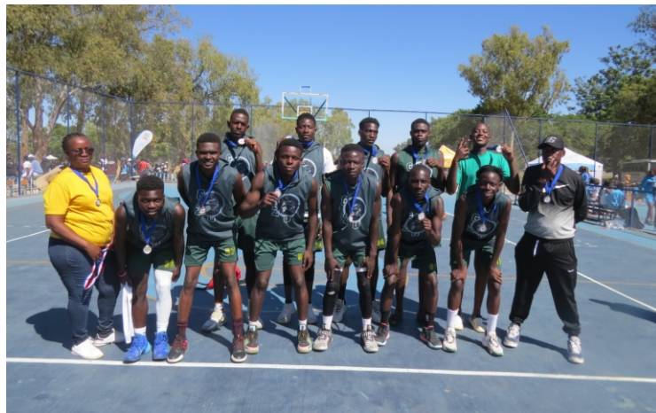
Team GZU at the ZUSA games

T eam GZU put up a commendable performance at the just ended Zimbabwe University Sports Association Cluster 1 competitions that were held at Midlands State University.