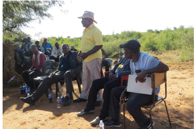
Proceedings at the meeting with the Chivi community

Great Zimbabwe University's Innovation Centre for Dryland Agriculture is working to bring new life to Chivi district through agriculture and also empowering the local community to take charge of their own future.