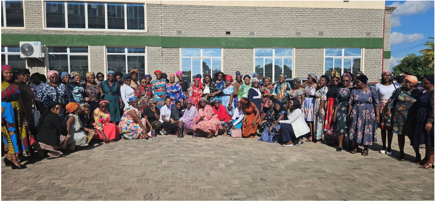
Great Zimbabwe University female employees at the Women's Day Luncheon

G reat Zimbabwe University celebrated International Women's day in style with a luncheon and motivational talk for the University's female employees.