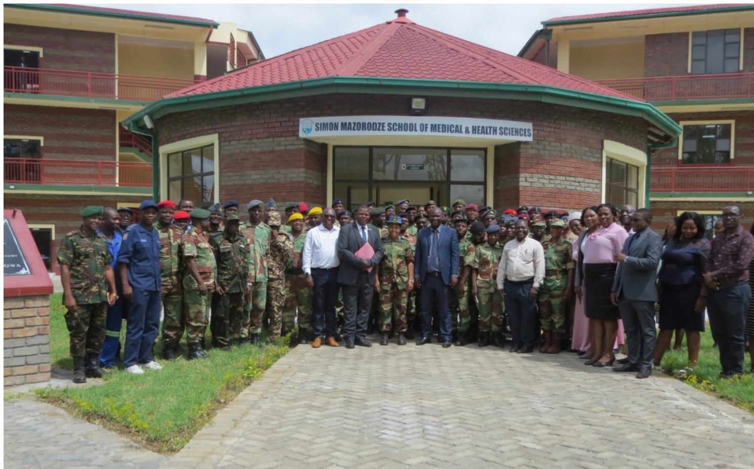
Zimbabwe Staff College pose at the Simon Mazorodze School of Medical Sciences